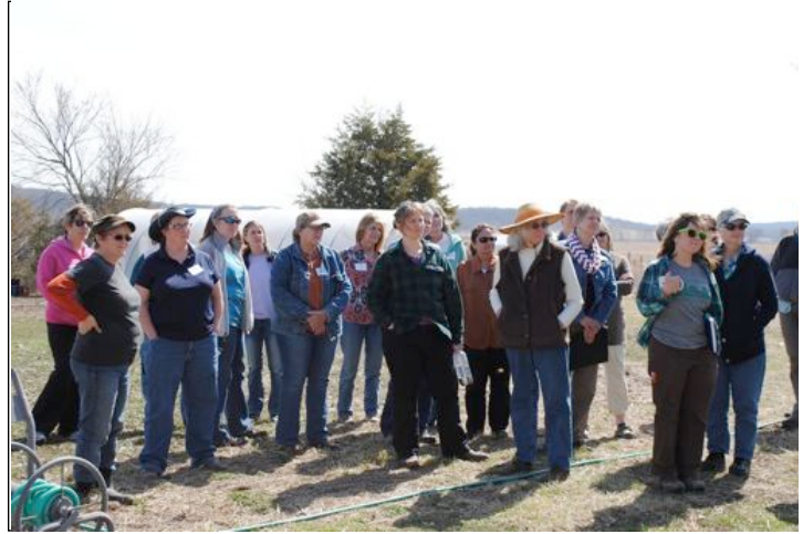
Above left, women listened to presentations on available resources from County Conservation Districts, the Farm Service Agency and Farm to School programs, plus food safety. Women gathered at the farm tour for discussion with other women farmers at the March 14 workshop.