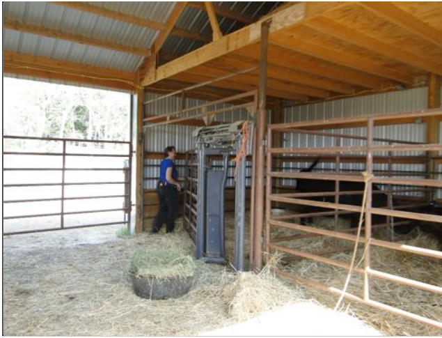
The maternity barn saves a lot of time and human energy. "Neighbors thought I was crazy," Stuenkel remembers. But now call to borrow it."